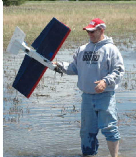
It was a little wet here, too!