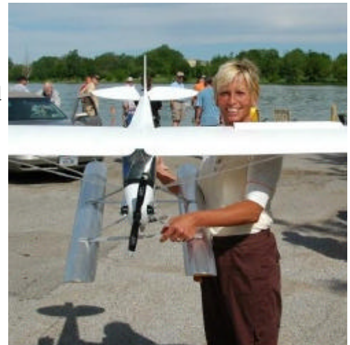
...and with her favorite plane