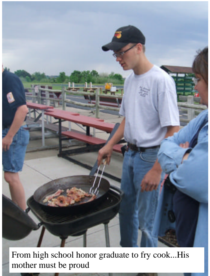
From high school honor graduate to fry cook...His mother must be proud