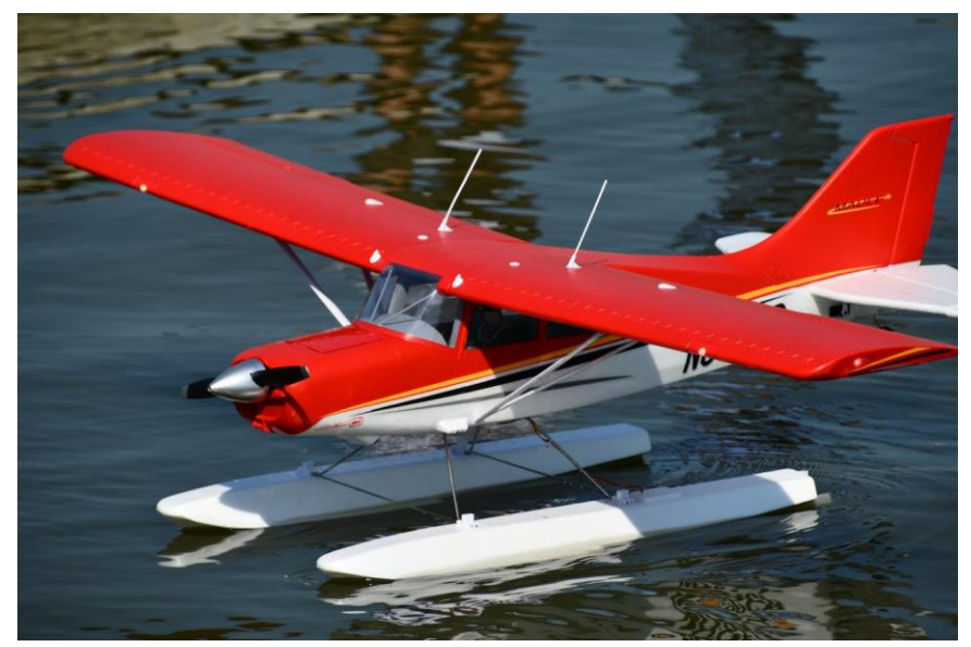
E-flite Maule both Skippy and Cole flew these.

Have a look at this link that Dan Creagan provided us with many excellent pictures from the float fly: http://www.creagan.net/test/Gallery/