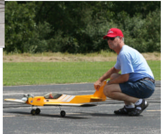
A good day for spectators, but a bad day for airplanes...