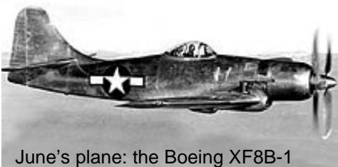
June's plane: the Boeing XF8B-1