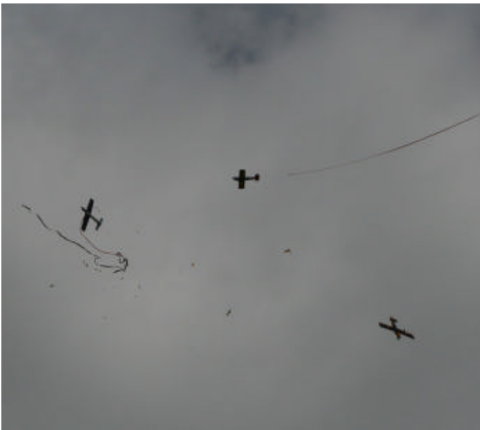
It's just what everybody wants - a mid-air!