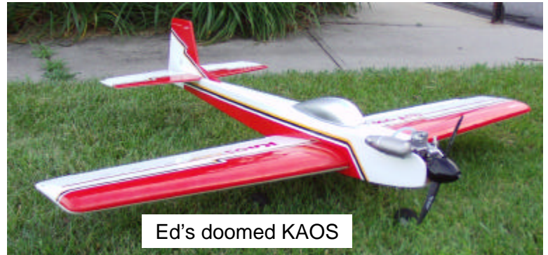
Ed's doomed KAOS