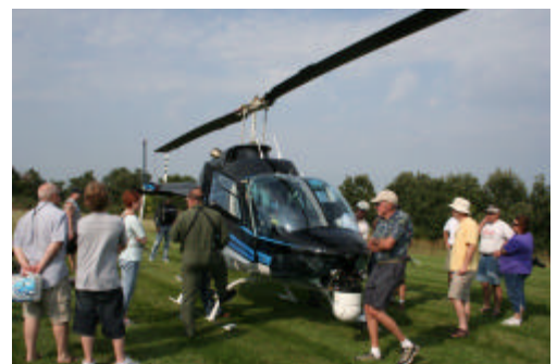
This one might be too big for the pad...