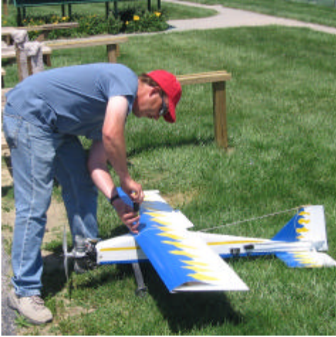
Multi-engine Fun Fly