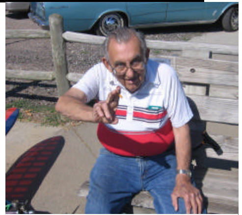
The doctor who told me to quit smoking is dead!