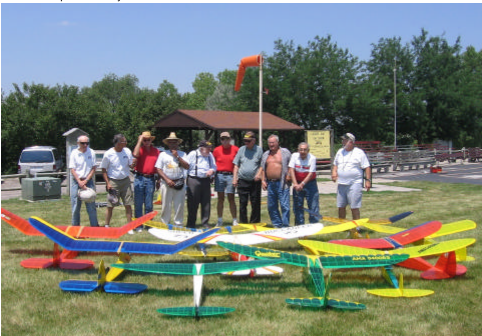
A bunch of Old Timers and their pilots