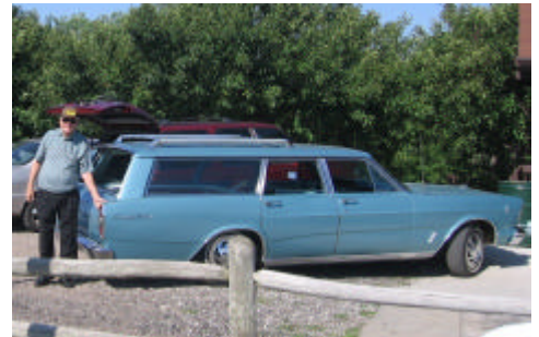
Ralph's car is an old timer, too!