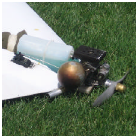
That's a weird looking muffler!