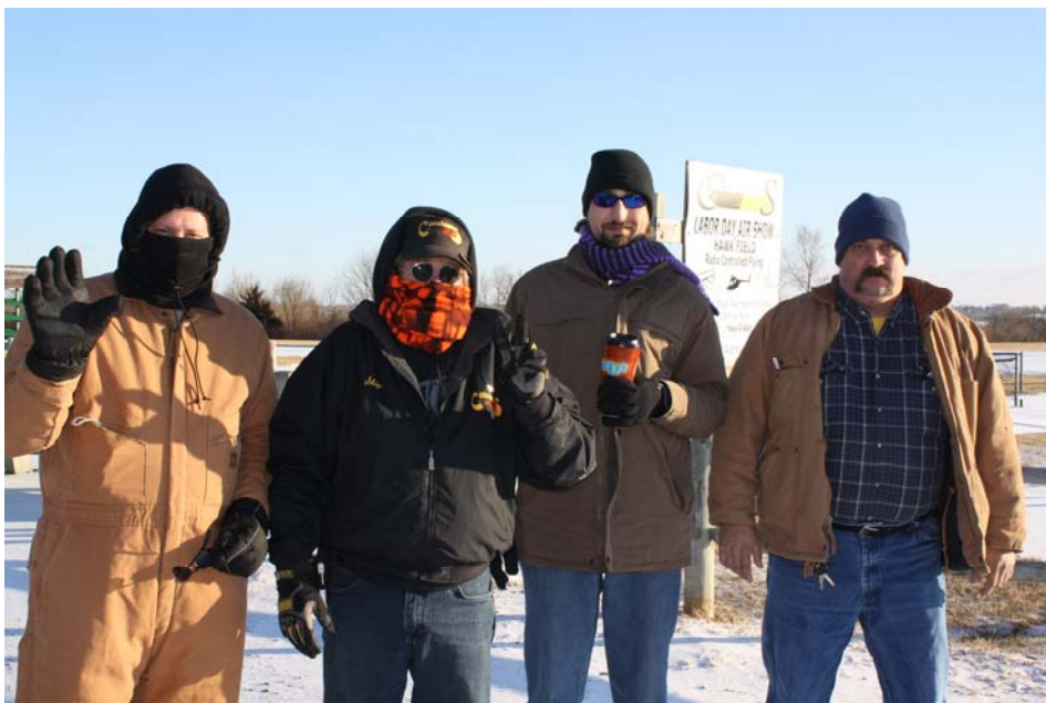
Take a guess. Which one of these guys works outdoors most of the time?