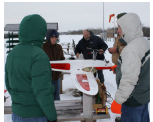
The R/C doctors all consulted, but the patient couldn't be revived.