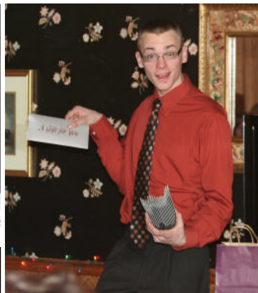
Would you accept a gift from this man?