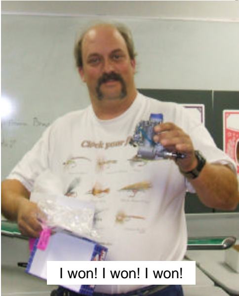
I won! I won! I won!