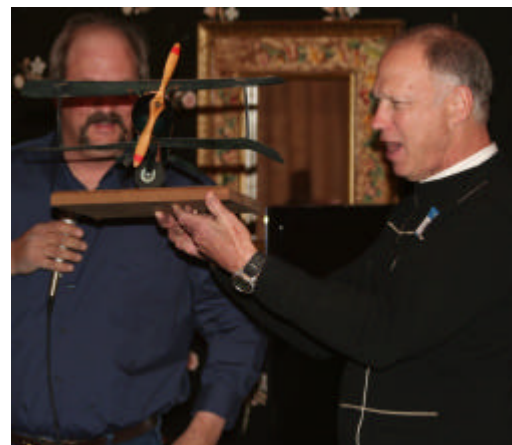
It's a major award!