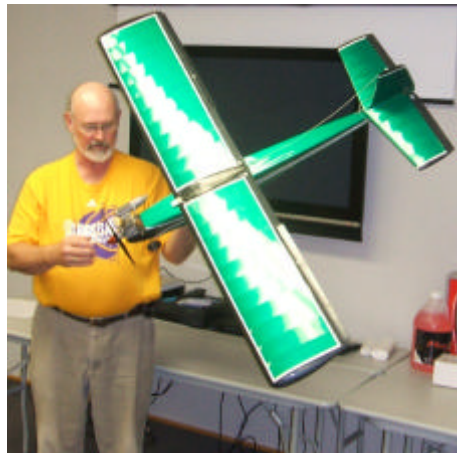
Is that a Falcon 56?