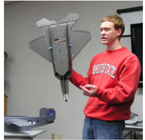
Fun with foam.

This poster is from Olie's Hobby Center. It was found during the renovation of the building for a new restaurant.