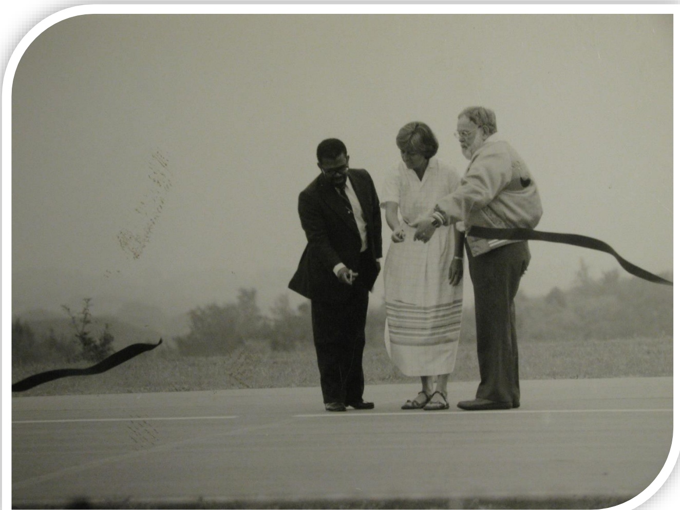
1987 Sept 5 Photo: Ribbon Cutting dedication of Hawkfield and new runway.

With the current discussions about replacing the Hawkfield runway, the following historical account seems truly fitting, this is about building of the original runway and dedication: