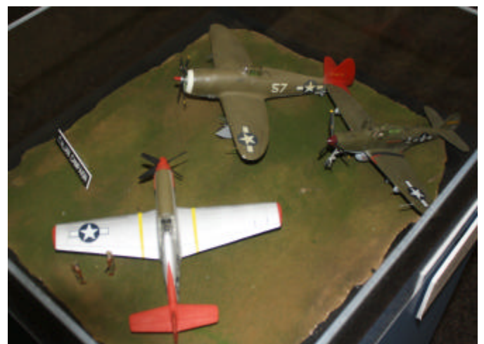
They have some really cool dioramas at the museum.