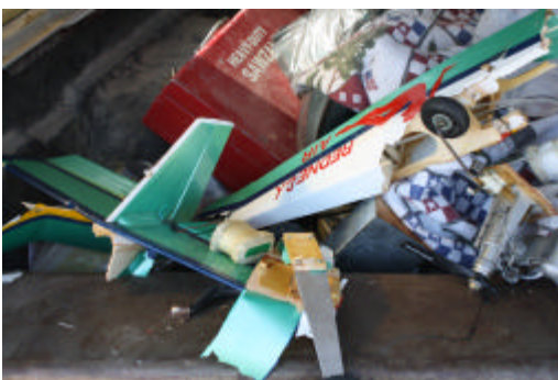
A sad,sad sight