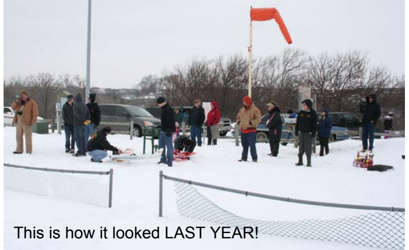
This is how it looked LAST YEAR!