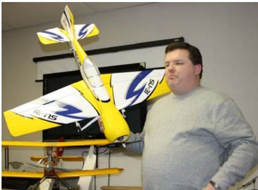
It's an ARF. Got a problem wit dat?