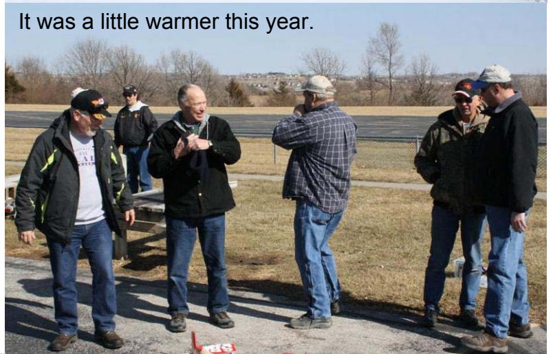
It was a little warmer this year.