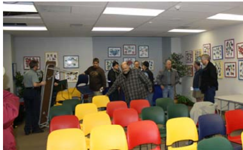
Pitching in to get set up