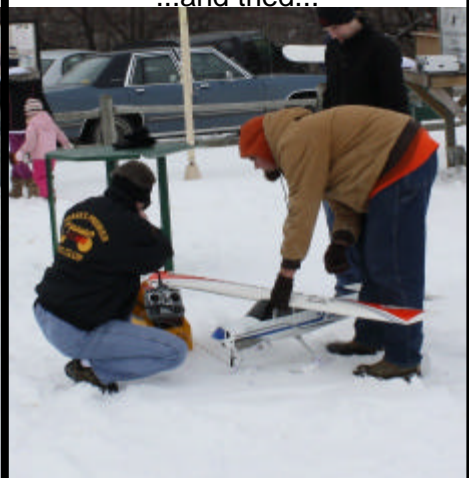
... and tried to get his plane to run. But in the end it failed him and he was forced to give up and donate his money to the cause. Those who flew were very grateful!