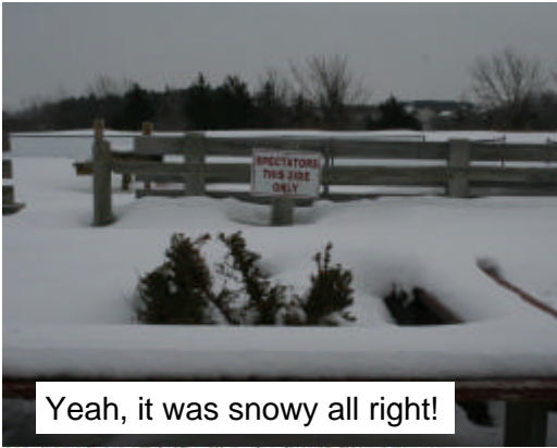
Yeah, it was snowy all right!

Cold and snowy is the way we always want our Winter Festival to be. And boy was it! This year, there was about four inches of snow on everything along with the remains of the fourteen inches of snow we got on Christmas. The runway was completely covered with snow. Good news for those who had skis on their planes, bad news for everybody else.