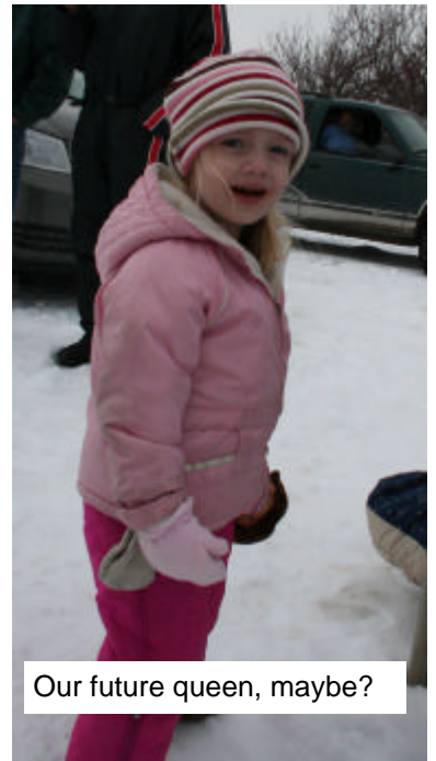
Our future queen, maybe?