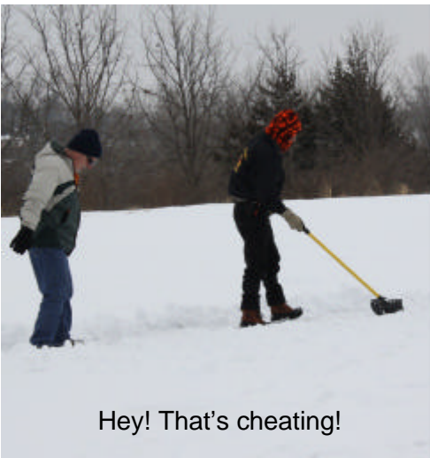
Hey! That's cheating!