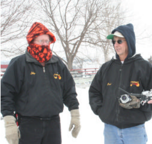
Don't talk to me about fashion!