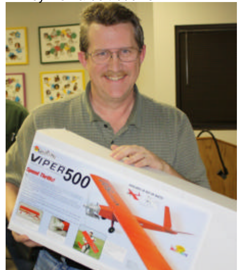
And EJ won a plane. It just doesn't seem fair!