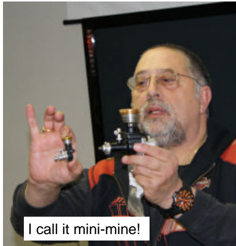
I call it mini-mine!