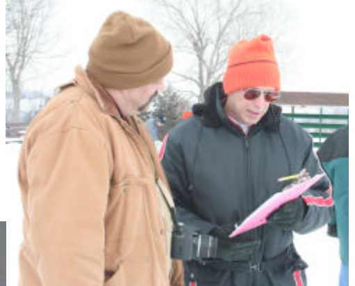
"Did Skip 'rise - off - ground'?" "He says he did."