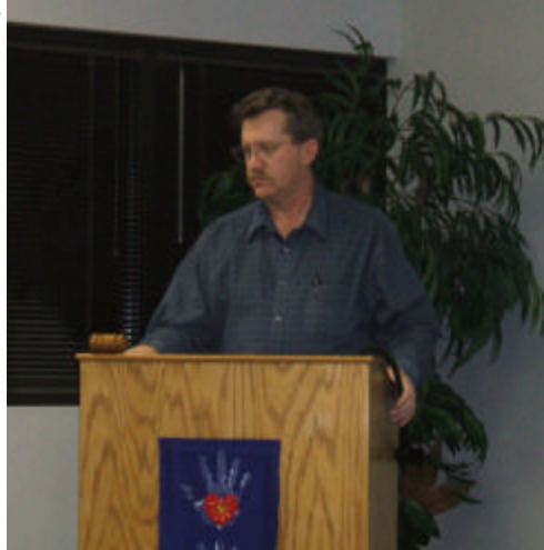
EJ's first meeting goes well