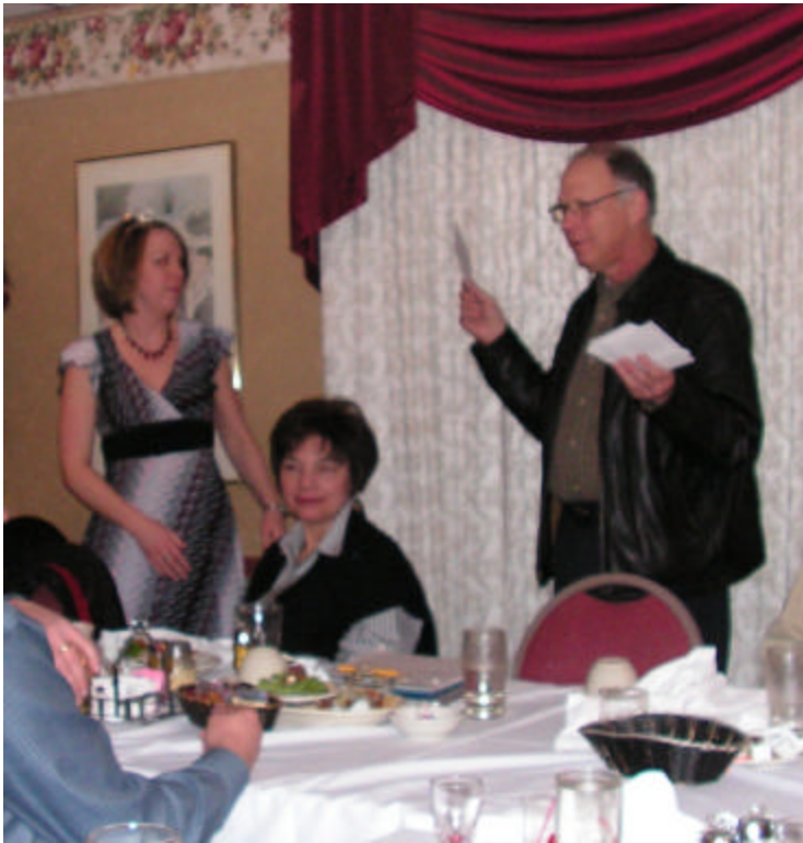
Handing out the cash...