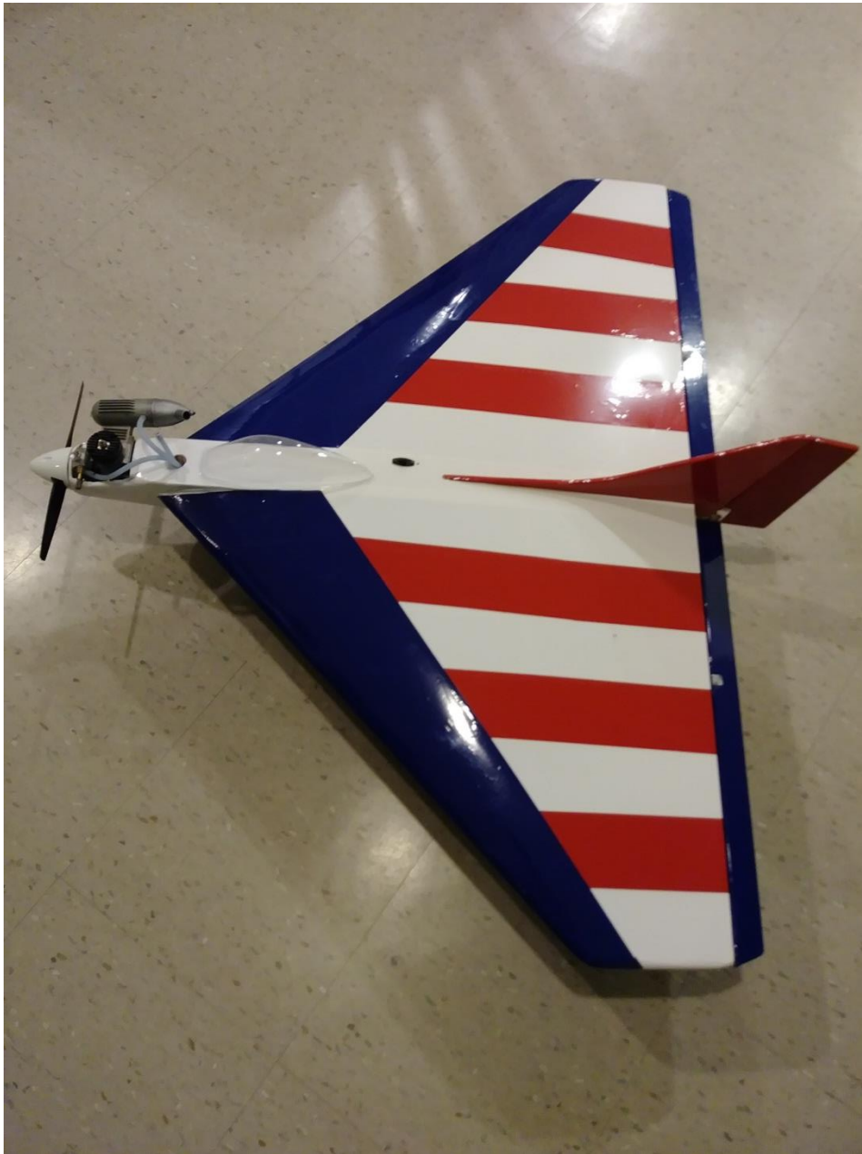
Tom Floyd's Comet

Built this Delta from a kit. It is called the Comet and is a laser cut kit from Old School Models . The engine is a Webra .35 Speed and is covered with Monokote.