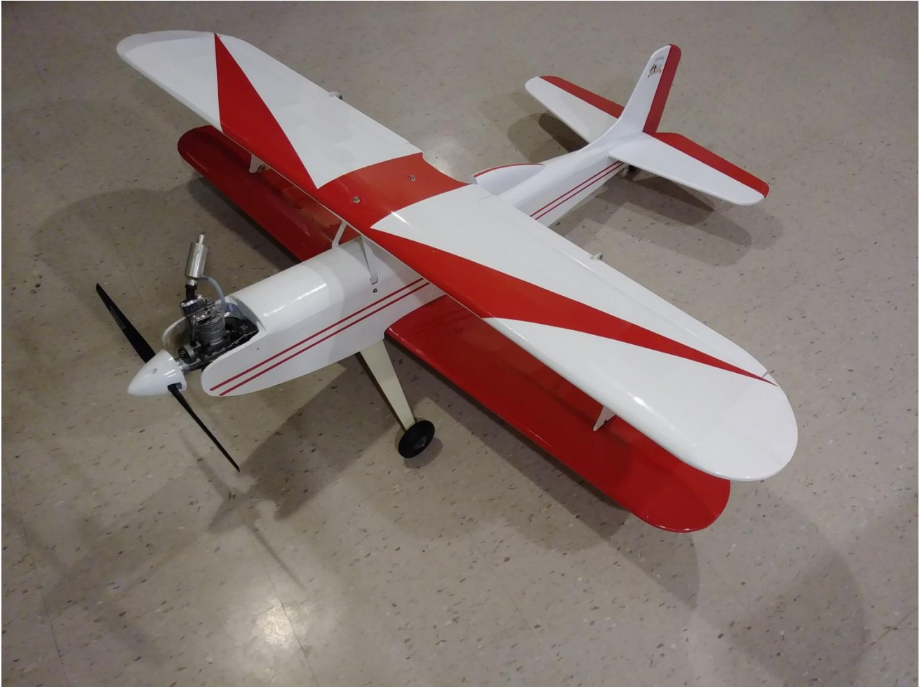
Tom Floyd's Sig Hog Bipe

Also was able to finish this Sig Hog Bipe . Power is a Saito 91 four stroke ; it is also covered in Monokote.