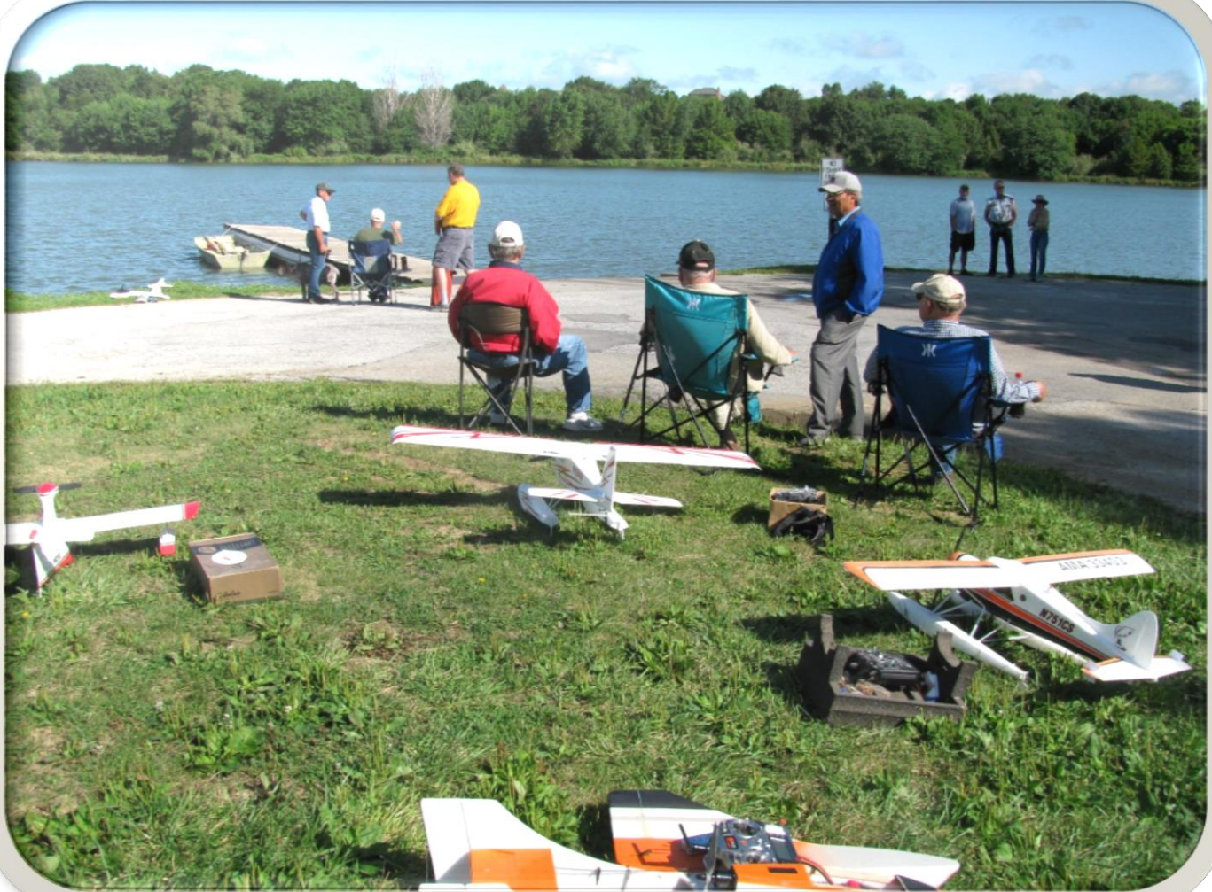
Boat area & Judges