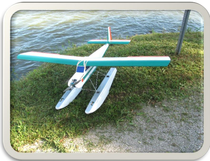
Loren Blindes' Telemaster 40, had first flight with floats on.