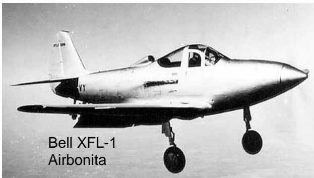
Bell XFL-1 Airbonita