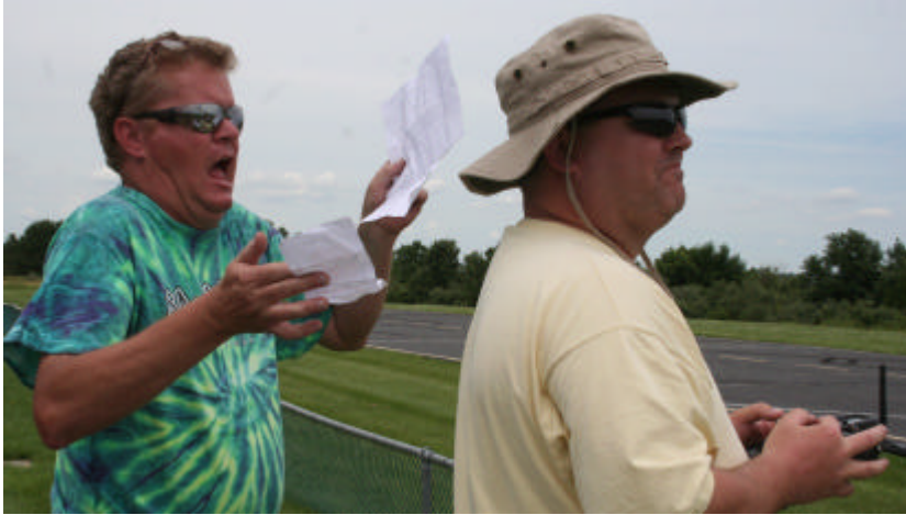
Did I say dive straight into the ground? Did I?