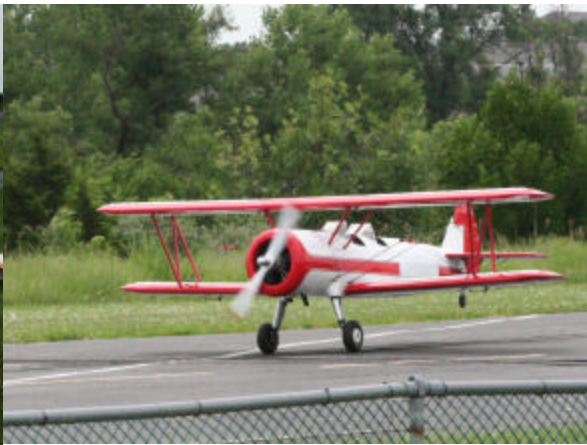
Geez, that's a big plane!