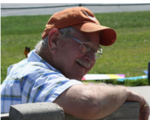
The hot dogs are free, right?