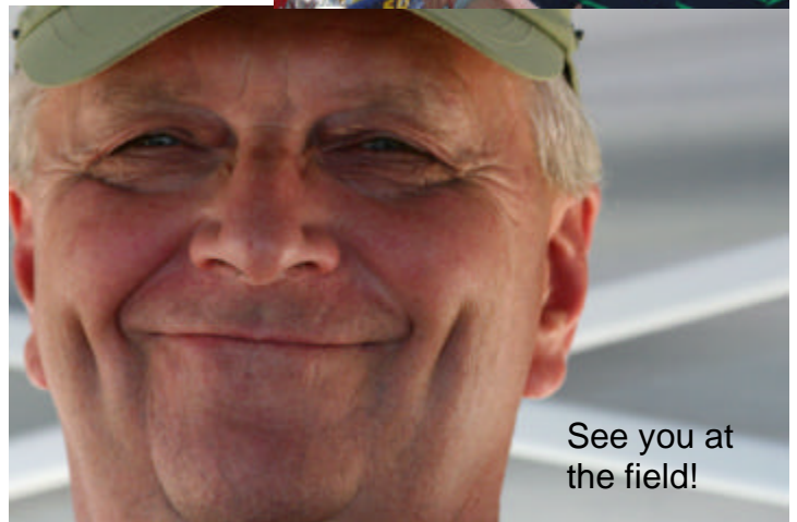
See you at the field!