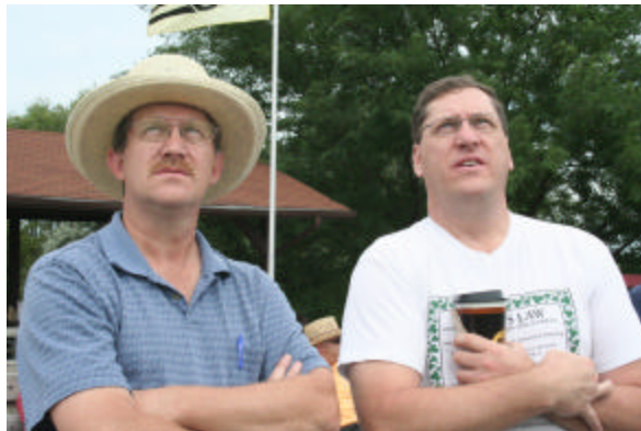
Cheer up EJ. This is a FUN fly!