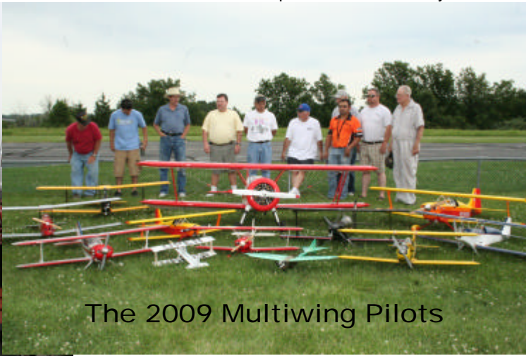
The 2009 Multiwing Pilots