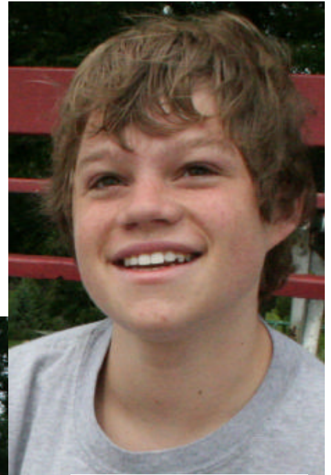
Another happy customer