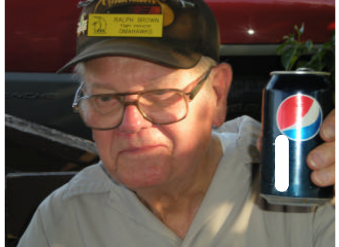
Ralphie's doing product endorsements now (but we aren't)