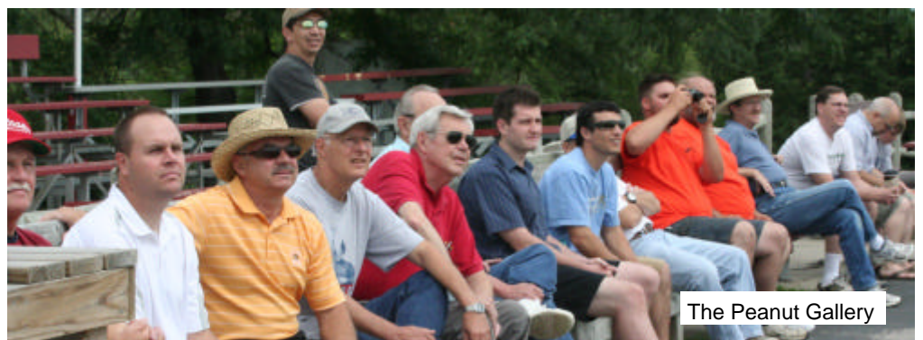
The Peanut Gallery