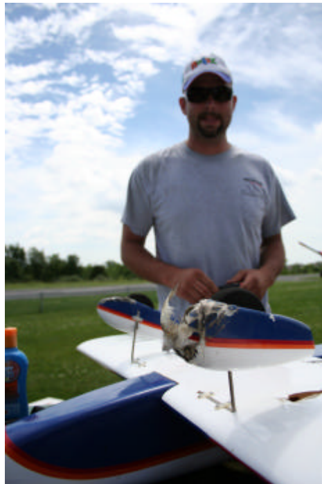
What can you say but "Ouch!"