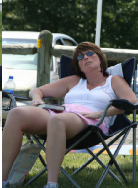
Pattern contests are sooo exciting!