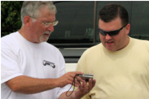
You didn't look silly in that one...