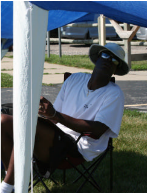
Does the box go all the way over there?