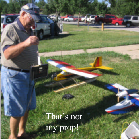
That's not my prop!