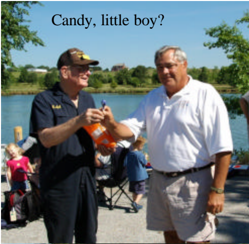
Candy, little boy?