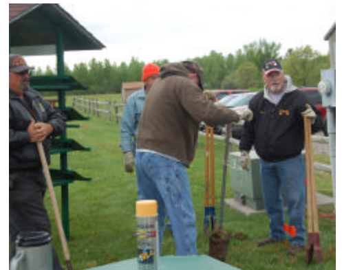
Four guys with shovels - one is working. Apparently this is a union job.