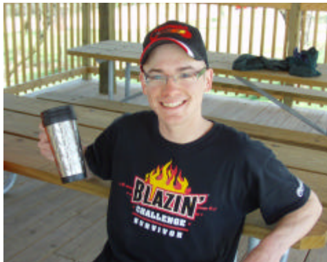
Did anybody actually see this guy work?