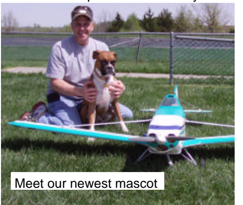
Meet our newest mascot