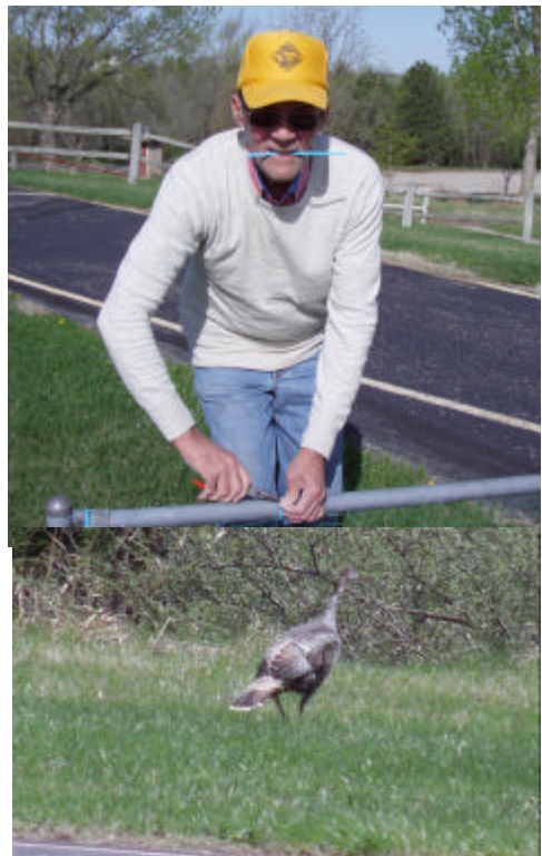
As God is my witness, I thought turkeys could fly!