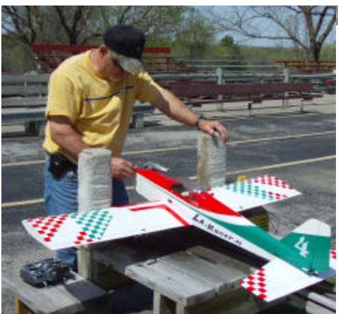
Clean-up done - Time to fly!