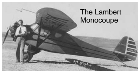
The Lambert Monocoupe

Yes, last month's mystery plane was the Lambert Monocoupe, built in Robertson, MO, right outside St. Louis. It was powered by a 90 hp engine and had a cruising speed of 110 mph. Lambert Aircraft Corporation built 32 of them in 1936.