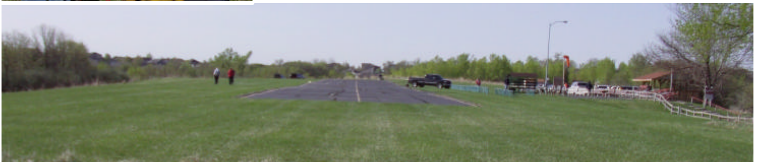
All cleaned up and ready to go!