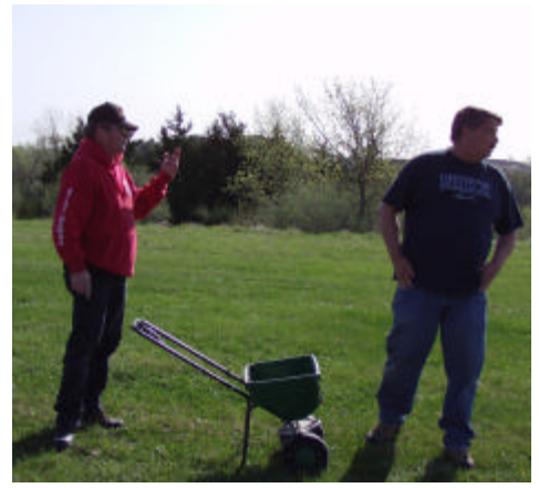
It's a fertilizer spreader, Skip. It's not that complicated!