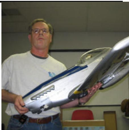
Is this worth four tickets?