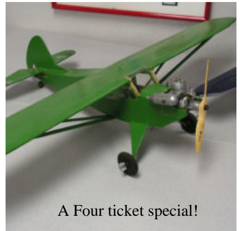
A Four ticket special!

Next Board Meeting – Wed, May 2 Pancake Breakfast – Tuesday, May 8 Presidents Day Egg Burn – Monday, May 28