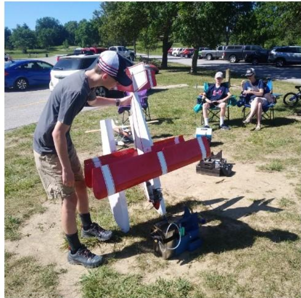
Loren Blinde Biplane on floats after it flipped over in the lake