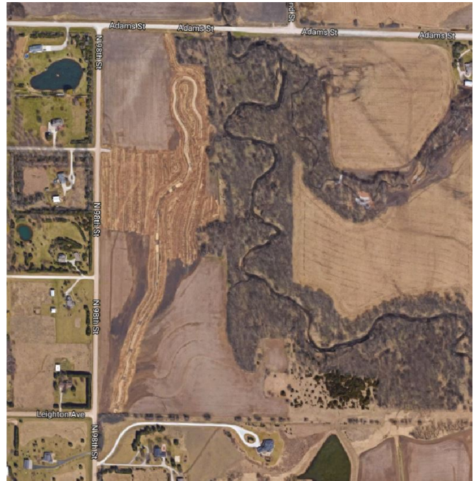
98th and Leighton

Landfill on north 56th street (Hwy 77) just east of the city dump transfer station; Jim reports other groups are interested in this area including the skeet shooters, and BMX bike racers. A crude check of the map shows it could possibly be out of the 5 mile airport radius but it is close.