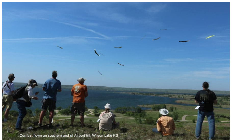
Combat flown on southern end of Airport hill, Wilson Lake KS