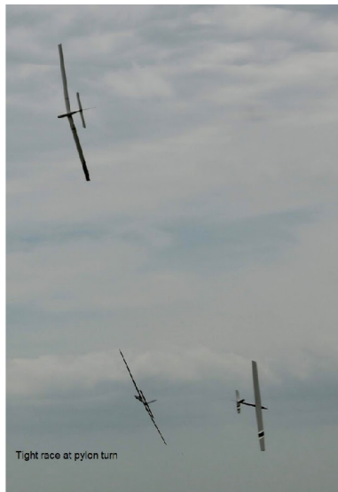
Tight race at pylon turn