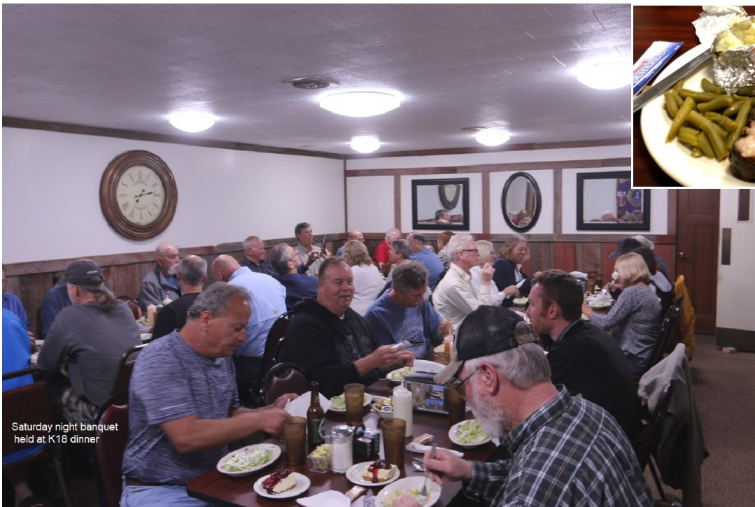
Saturday night banquet held at K18 dinner