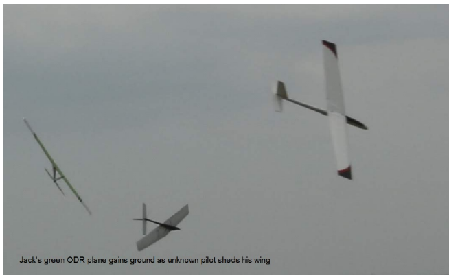
Jack's green ODR plane gains ground as unknown pilot sheds his wing