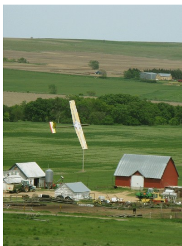
Thane's tape-patched ODR plane