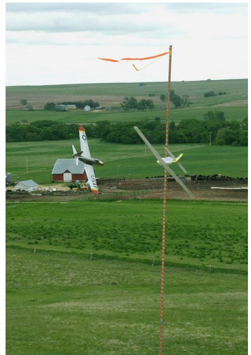
War Bird Race