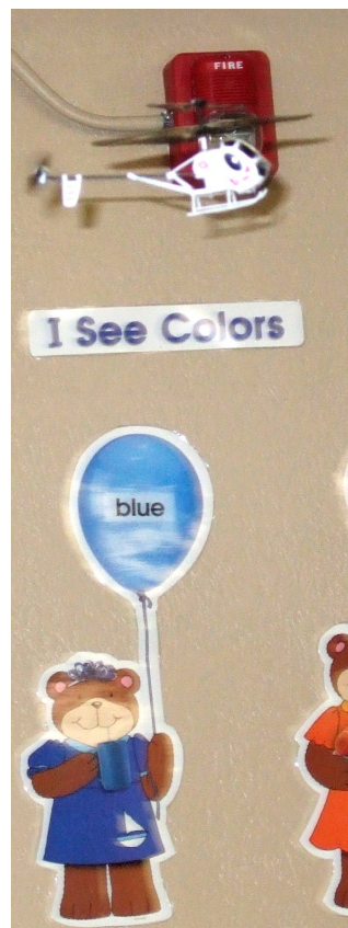
Flight Demos by Jim's helicopter at Willard