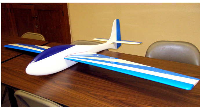
Loren Blinde's Le Fish by Leading Edge Gliders at the December meeting.