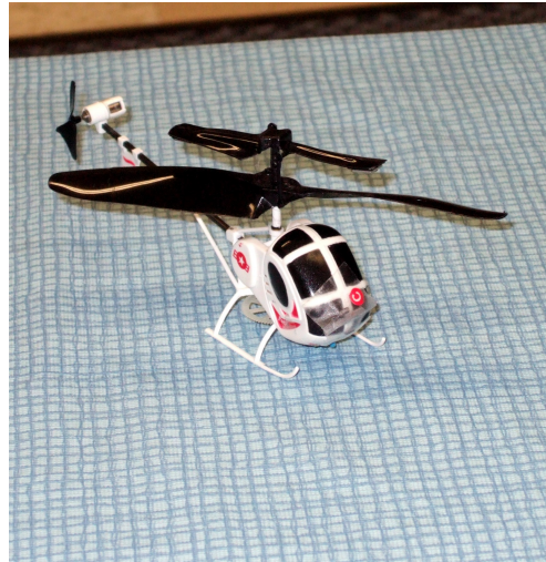
Jim Baker's two micro heli- copters