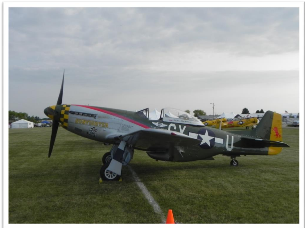
P-51 "GunFighter"