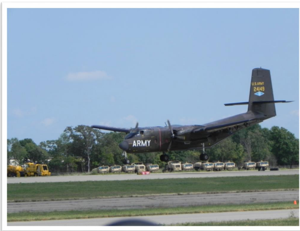
De Havilland Caribou