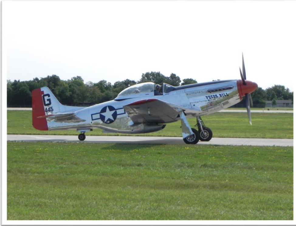
P-51 "Pecos Bill"