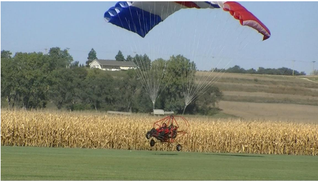
First launch and flight of Steve's PPC with test pilot JD at the controls.