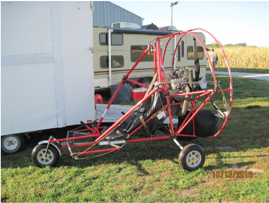
Steve's powered parachute which JD successfully test flew. JD managed to get in flights all 3 days of the fly-in.