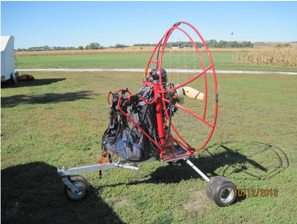
Arlin's powered paraglider (PPG) trike.