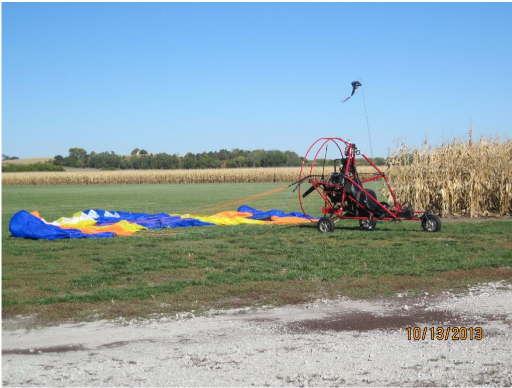
Mel's powered parachute after a successful sortie.